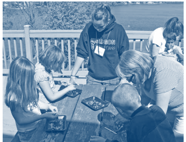
Third graders from Gier Elementary, working diligently on a craft project to be donated to 'Meals on Wheels' clients.

AS PART of an ongoing effort to introduce the tradition of philanthropy to young people, the Hillsdale County Community Foundation has expanded its Elementary Philanthropy program this year to include eight area schools. The program was taught to third graders at Will Carleton Academy, Gier Elementary in Hillsdale, Camden-Frontier Elementary, Litchfield Elementary North Adams-Jerome Elementary, Williams Elementary in Jonesville, Pittsford Elementary, and Reynolds Elementary in Reading.